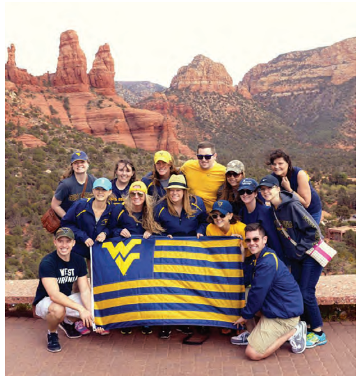
▲ Our School of Nursing students took advantage of the opportunity to represent West Virginia University at the National Student Nurses Association's 63rd Annual Conference where they gained valuable insights into many of today's pressing nursing topics.