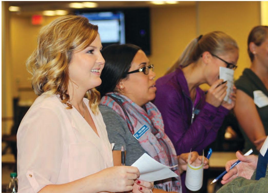
▲ Students at WVU Health Sciences participate in a speed networking session aimed at gaining more information about their healthcare peers.

“We had to work together, with limited resources, to think critically and make the best decisions, together as a team, for our patients.”